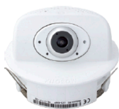
p26 camera, lens B016-B237