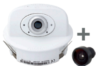
p26 camera body und lenses B036 to B237 for self-mounting