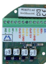
MxIOBoard-IC for signal input/output (accessories)