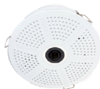
c26 with lens B016