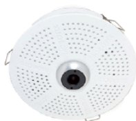
c26 with lens B036